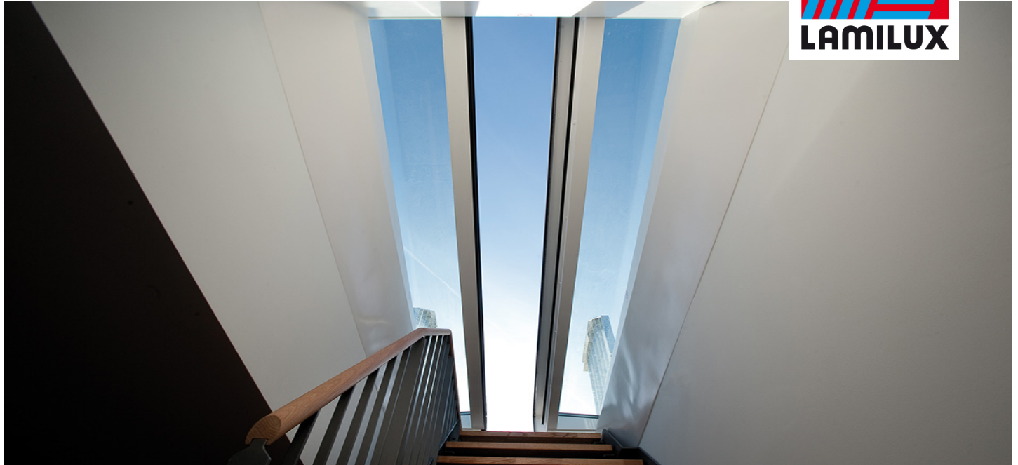
Projekt - penthouse w Berlinie