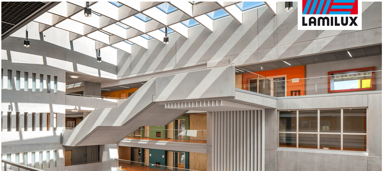
Projekt - szkoła w Neumarkt i.d.OPF.