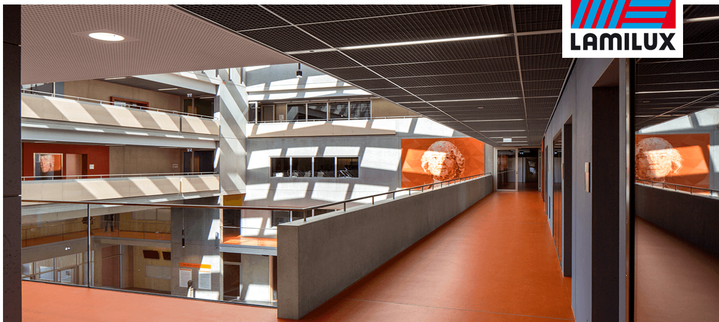
Projekt - szkoła w Neumarkt i.d.OPF.