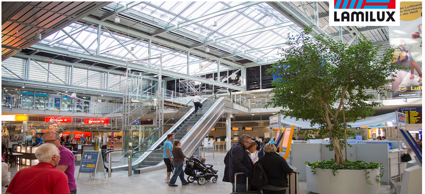
Projekt - lotnisko w Norymberdze